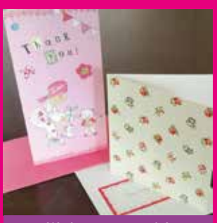
We love your cards!