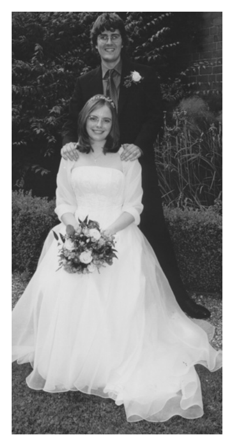
My love and best wishes to you all