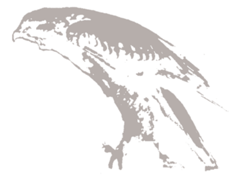
'To everyone, a big hello, hoot, growl and sniff from all of the furry, feathered, scaly and human residents of Gentleshaw Wildlife Centre' Yerevan

If for religous or other reasons you don't celebrate birthdays, let us know so that we can make other arrangements for you.